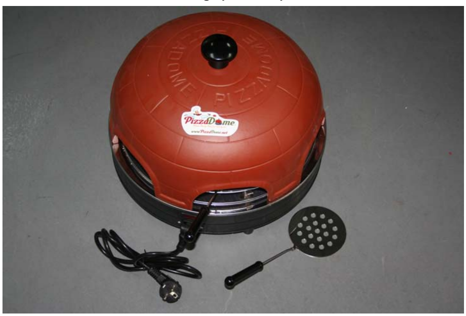
PIZZADOME ***End of Report ***

This Test Report is issued by the Company subject to its Conditions of Issuance of Test Report printed overleaf or attached. The results shown in this Test Report refer only to the sample(s) tested unless otherwise stated and such sample(s) are retained for 30days only. This Test Report shall not be reproduced expected in full, without written approval of the Company. AOV Testing Technology Co. Ltd 深圳市安姆特测试技术有限公司